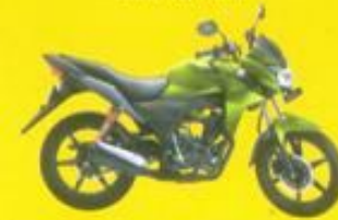
Candy Palm Green

1. CB Twister meets Bharat Stage III Norms. 2. *Based on Indian mode - Internal Honda riding mode based on various simulated actual riding conditions. 3. +The technical specifications and designs of bike shown here may vary according to requirements and subject to change without any notice. 4. Accessories shown in the picture may not be part of the standard equipment.