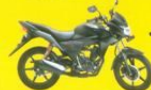
Pearl Nightstar Black