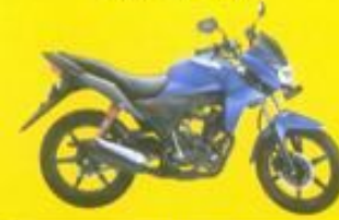
Pearl Fiji Blue