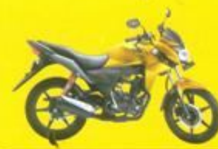
Electric Yellow Metallic

Standard version with Self Drum / Kick Drum also available.