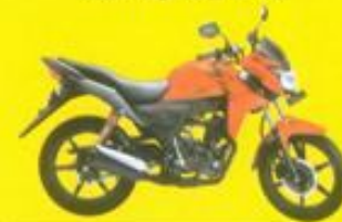
Pearl Siena Red