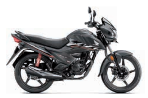
MATTE AXIS GRAY METALLIC